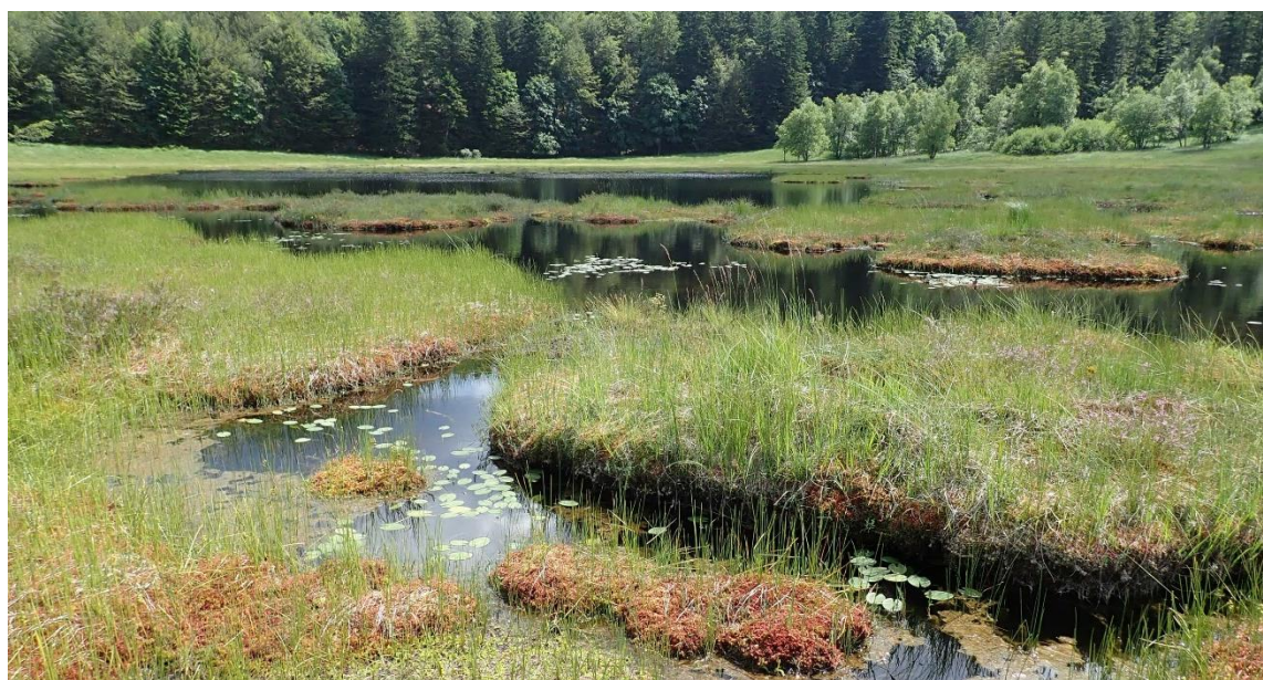
Photo 2. Corynoneura magna : locality in Vosges region.

Photo 1. Corynoneura magna : localité dans le département des Ardennes.