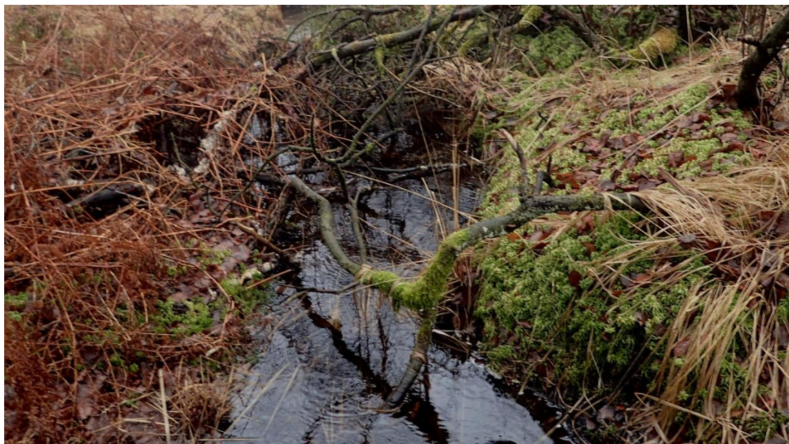
Photo 1. Corynoneura magna : locality in Ardennes region.

Mots-clés : Corynoneura magna , adulte mâle, nouvelle description, sources et tourbières acides, mesures de conservation.