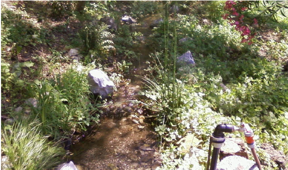
Photo 2. Type-locality of Pseudosmittia beverana sp. n.: riparian habitats bordering the upper basin of the River Bevera, where the type-material was collected. Photo J. Moubayed, 25.VI.2016.