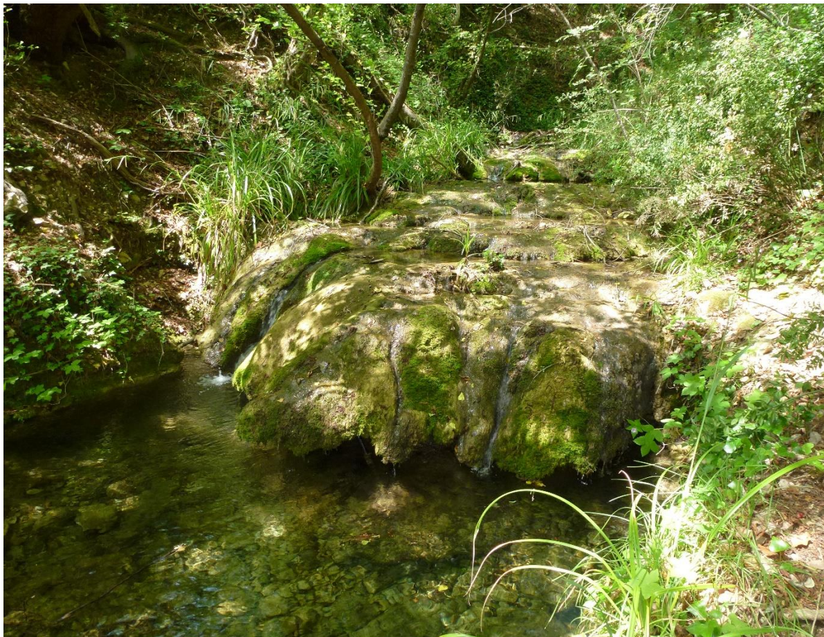
Photo 1. Gouargas stream, near Moulinet village (Maritime Alps); type-locality of P. beverana sp. n. Photo J. Moubayed, 25.VI.2016.

Mots-clés : taxonomie, nouvelle espèce, Sud-Est France, mesures de conservation.