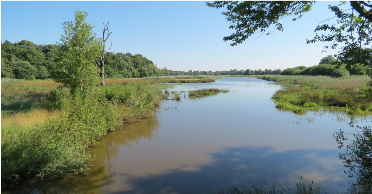
Photo 2. Type-locality of Pseudosmittia aina sp. n.: riparian habitats bordering the ponds of the Dombes Region (Ain french department; eastern France).