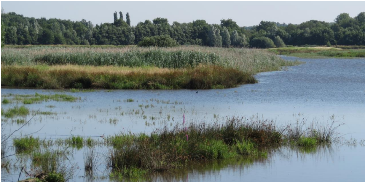
Photo 1. Type-locality of Pseudosmittia aina sp. n.: riparian habitats bordering the ponds of the Dombes Region (Ain french department; eastern France).